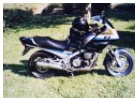
Ready for a Blip !