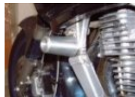
Alloy 'Mushroom' best not tried out !