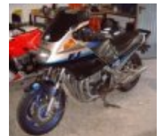
3XW and friend !