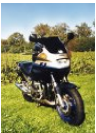
Turned out nice Again !