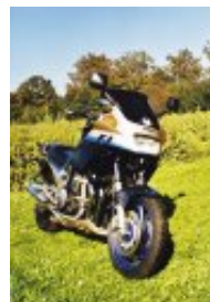
Showing Flip Screen