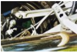
Alloy Torque Arm