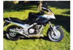
Bike looks virtually Stock